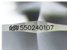
Sample Image Used